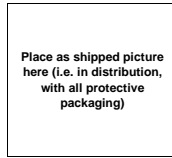
As shipped (actual may differ)